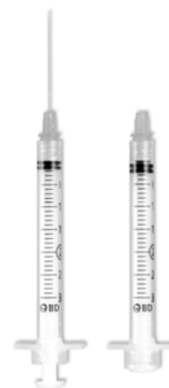
BD Integra 3 mL Syringe before activation BD Integra 3 mL Syringe after activation