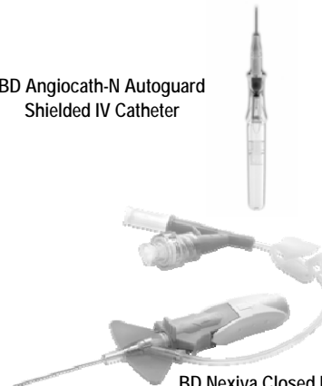
BD Nexiva Closed IV Catheter System-Dual Port