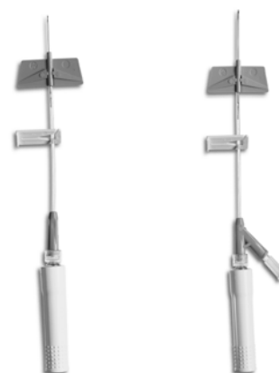
BD Saf-T-Intima Closed IV Catheter System with PRN