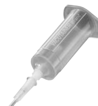
BD Blood Collection Assembly