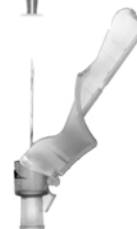
BD Eclipse Needle