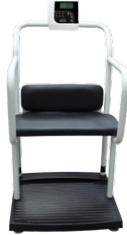
Bariatric/Handrail with Chair Seat Model 250-10-4