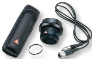
Photo Accessory Set

includes SLR Photo adaptor, adaptor cord, distance ring and BETA Belt Clip