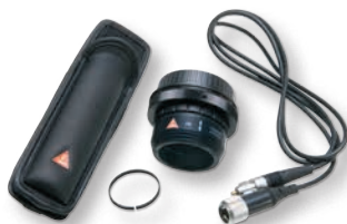
Photo Accessory Set

includes SLR Photo adaptor, adaptor cord, distance ring and BETA Belt Clip