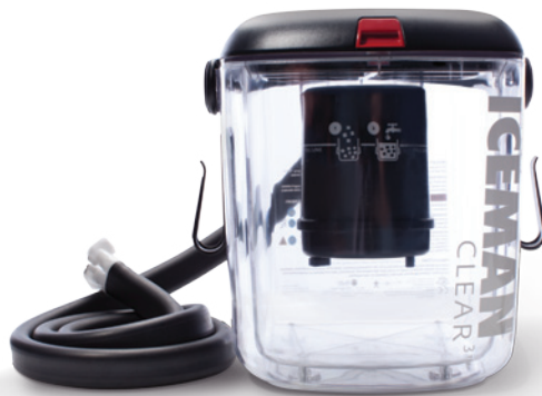
ICEMAN® CLEAR 3