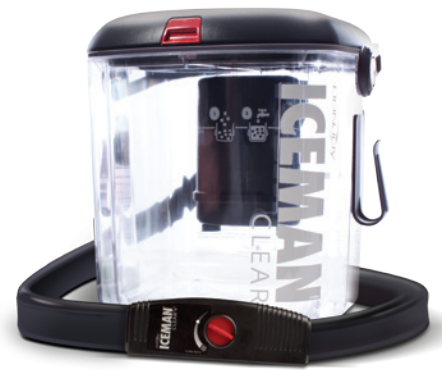
ICEMAN® CLEAR 3 +