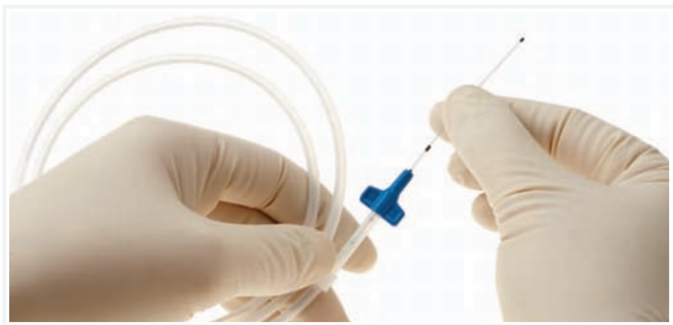
FlexTip Plus in Advancer Tube (available in select trays)