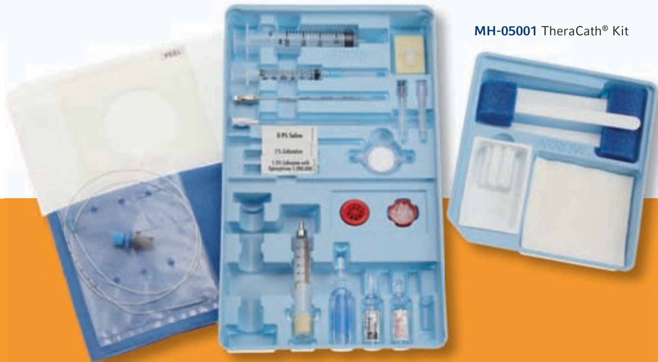
MH-05001 TheraCath® Kit